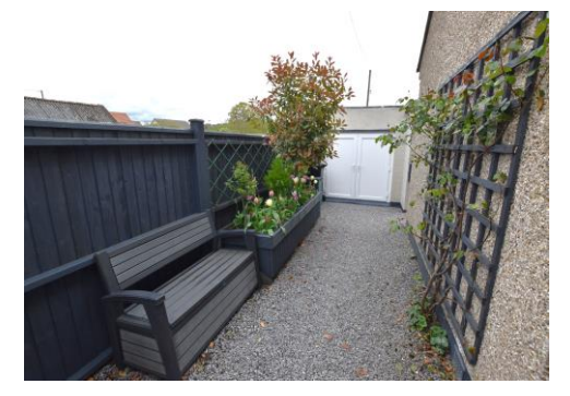
'An immaculate detached bungalow that is within easy level walk of the town centre, local schools for all ages and convenient public transport connections!'

This attractive detached bungalow has been tastefully modernised and renovated by the current owners and also enjoys a beautifully landscaped, level rear garden. As you enter the property there is a hallway providing access to all accommodation including a doorway into a light and bright lounge which overlooks the garden. The kitchen/breakfast room is in good order and has space for a table and there is a door to the side. Two double bedrooms and a bathroom. GCH and double glazing. The property has scope to extend subject to permissions being obtained and is offered for sale with no onward chain.